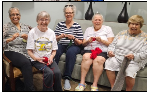
Lydia Needlecrafters has continued meeting throughout the summer months. Their work continues all year round.