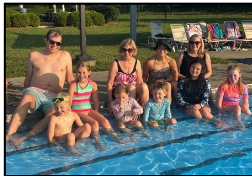
Last month the Moms & Kids group held a "back to school" swim.

https://www.signupgenius.com/go/10C0D4EAEA72AA2FBCF8-57458462-street